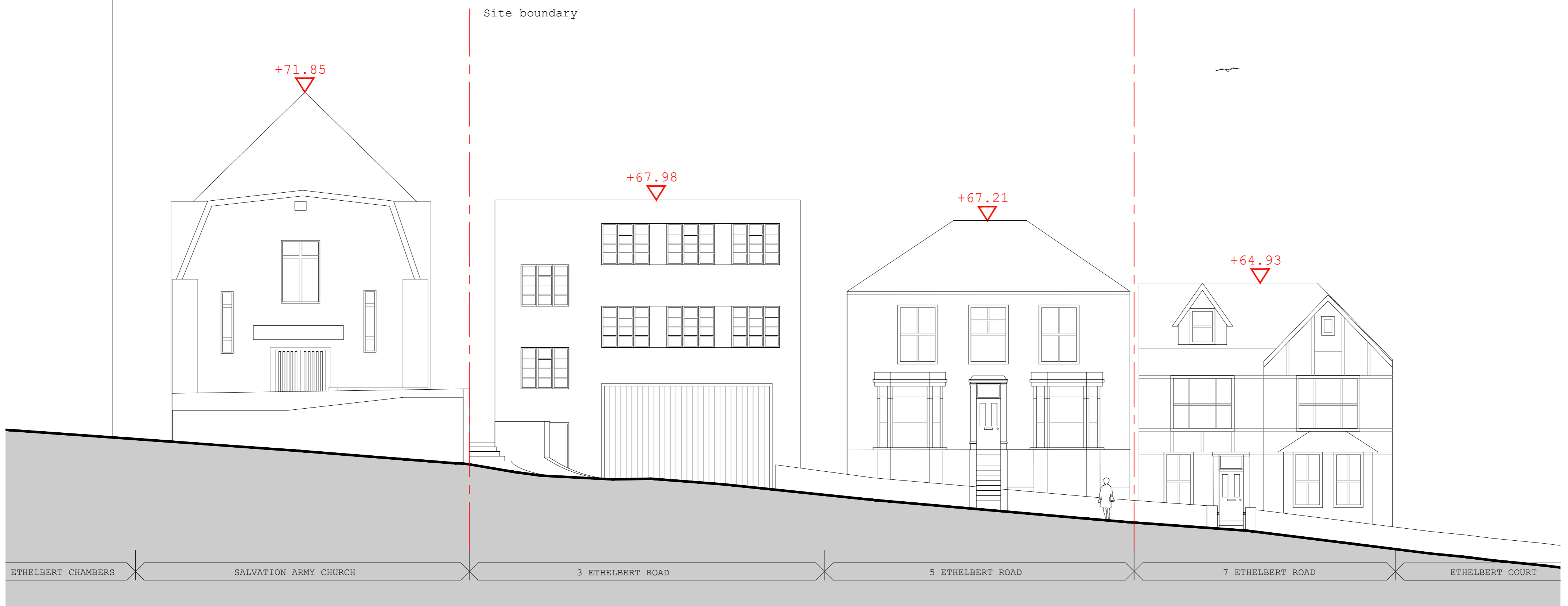
Existing Elevation from Ethelbert Road (A)