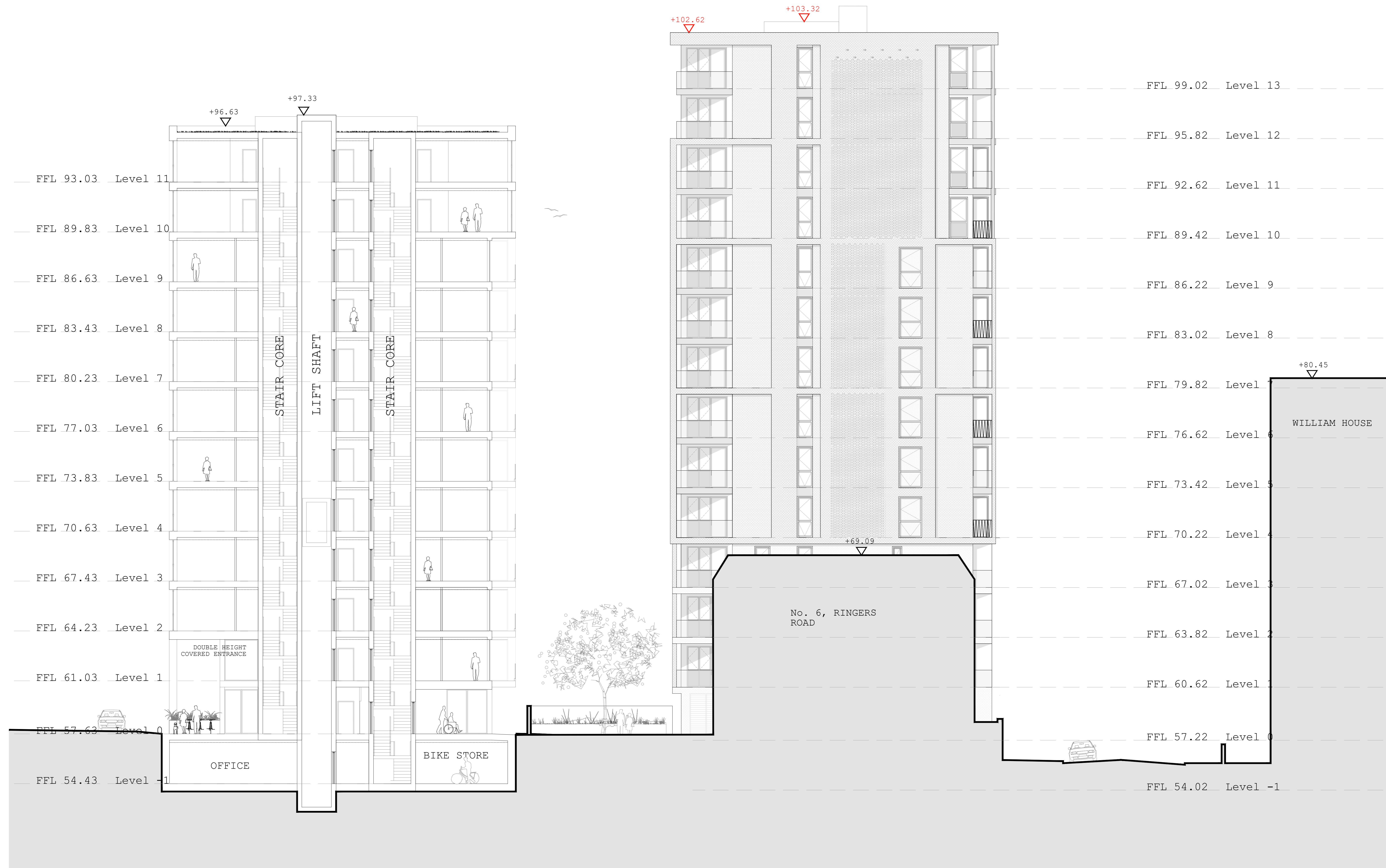
PROPOSED SECTION F-F'