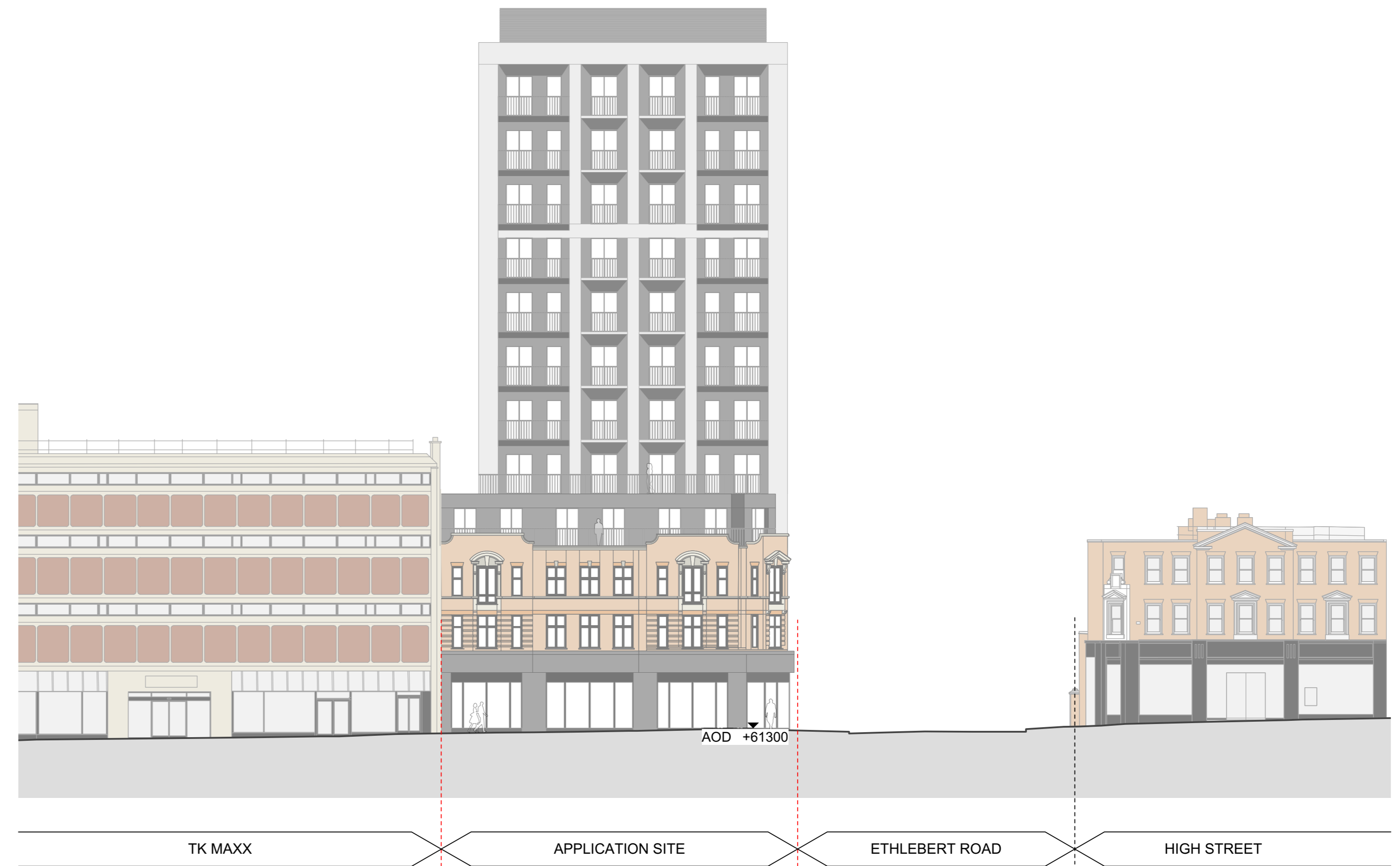
02 PROPOSED - East Elevation Scale: 1:200