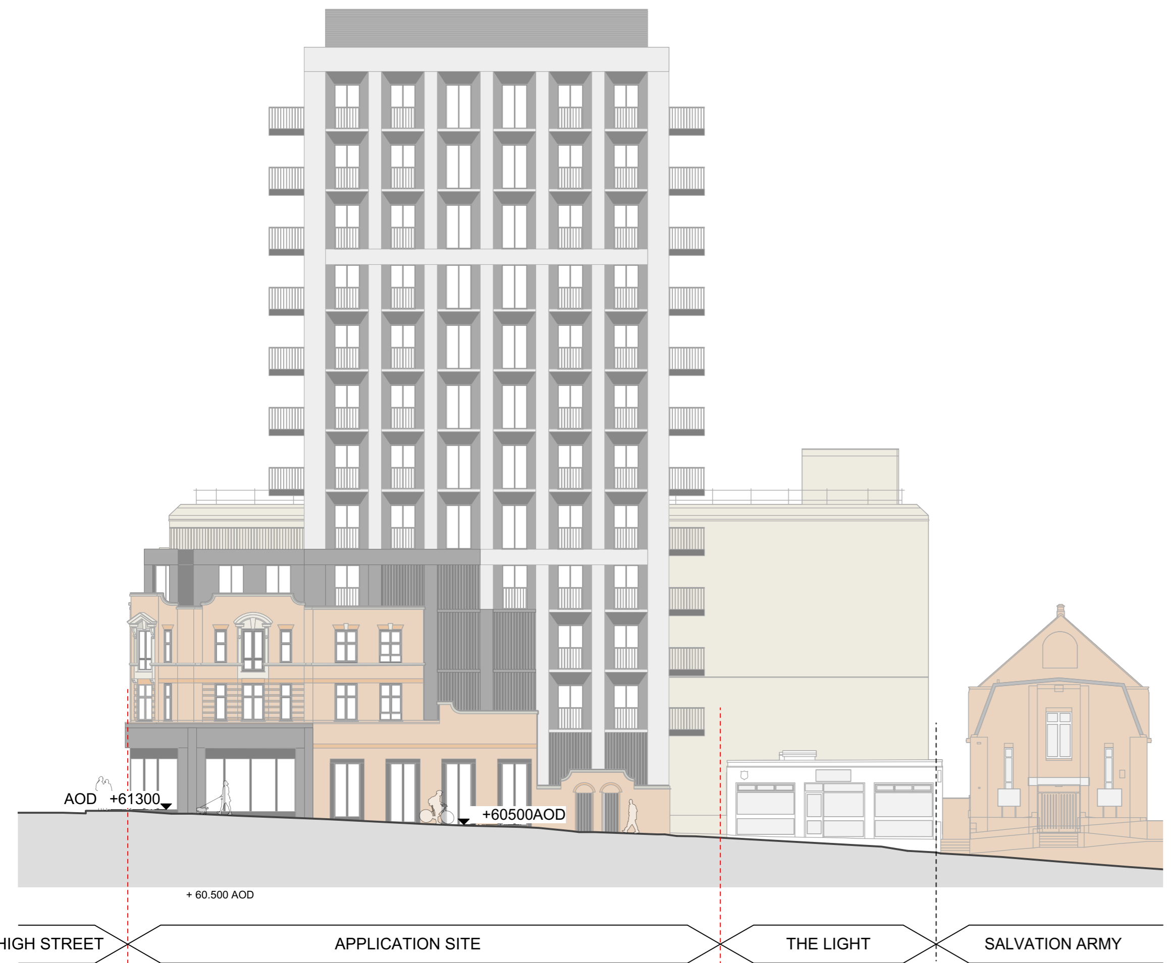
01 PROPOSED - North Elevation Scale: 1:200

+44 (0)20 7736 7744 info@assael.co.uk www.assael.co.uk