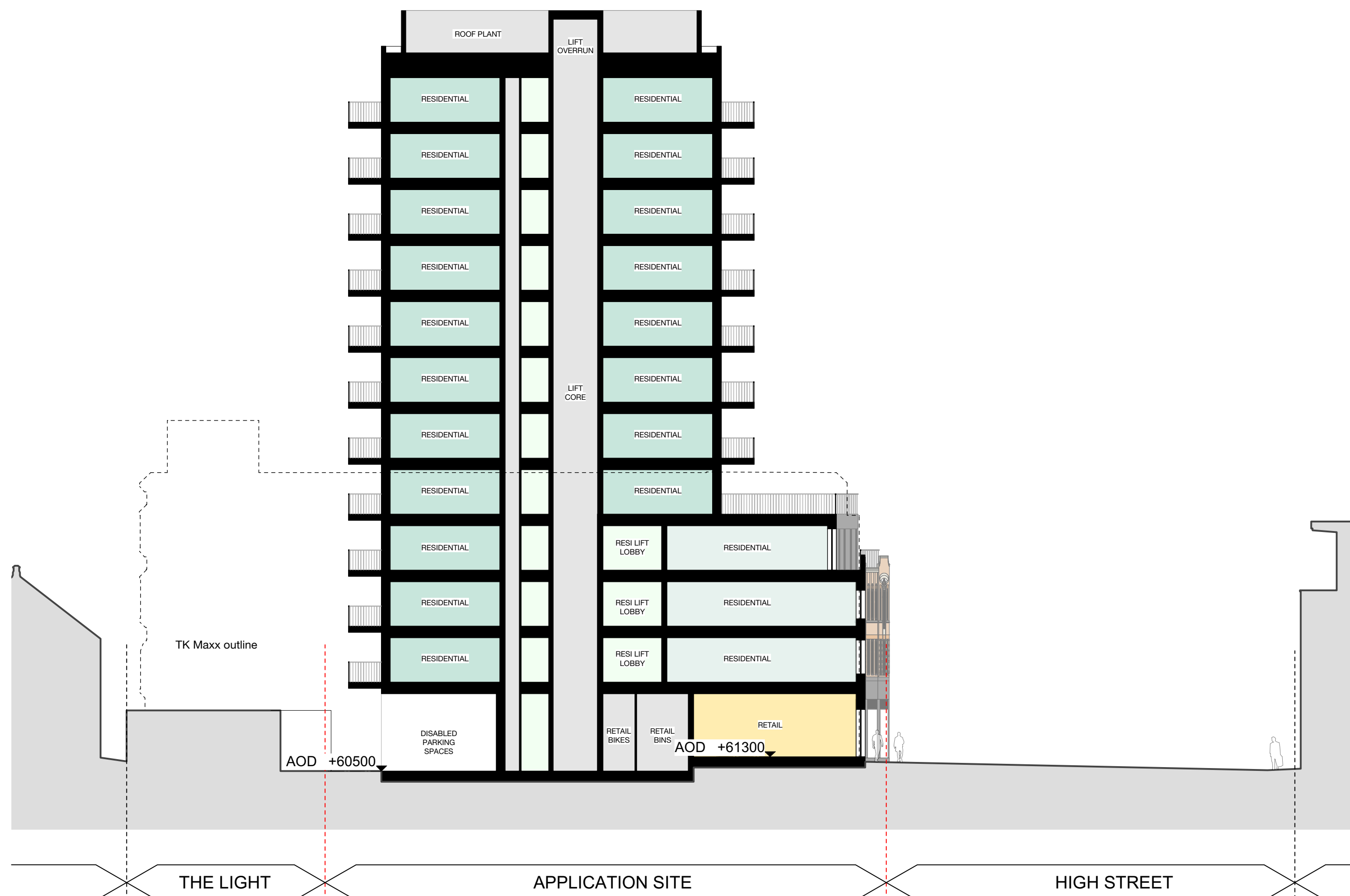
01 PROPOSED - Section AA Scale: 1:200

+44 (0)20 7736 7744 info@assael.co.uk www.assael.co.uk