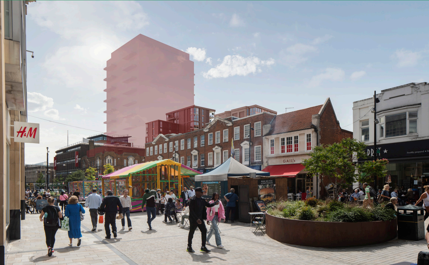
View 104 B High Street