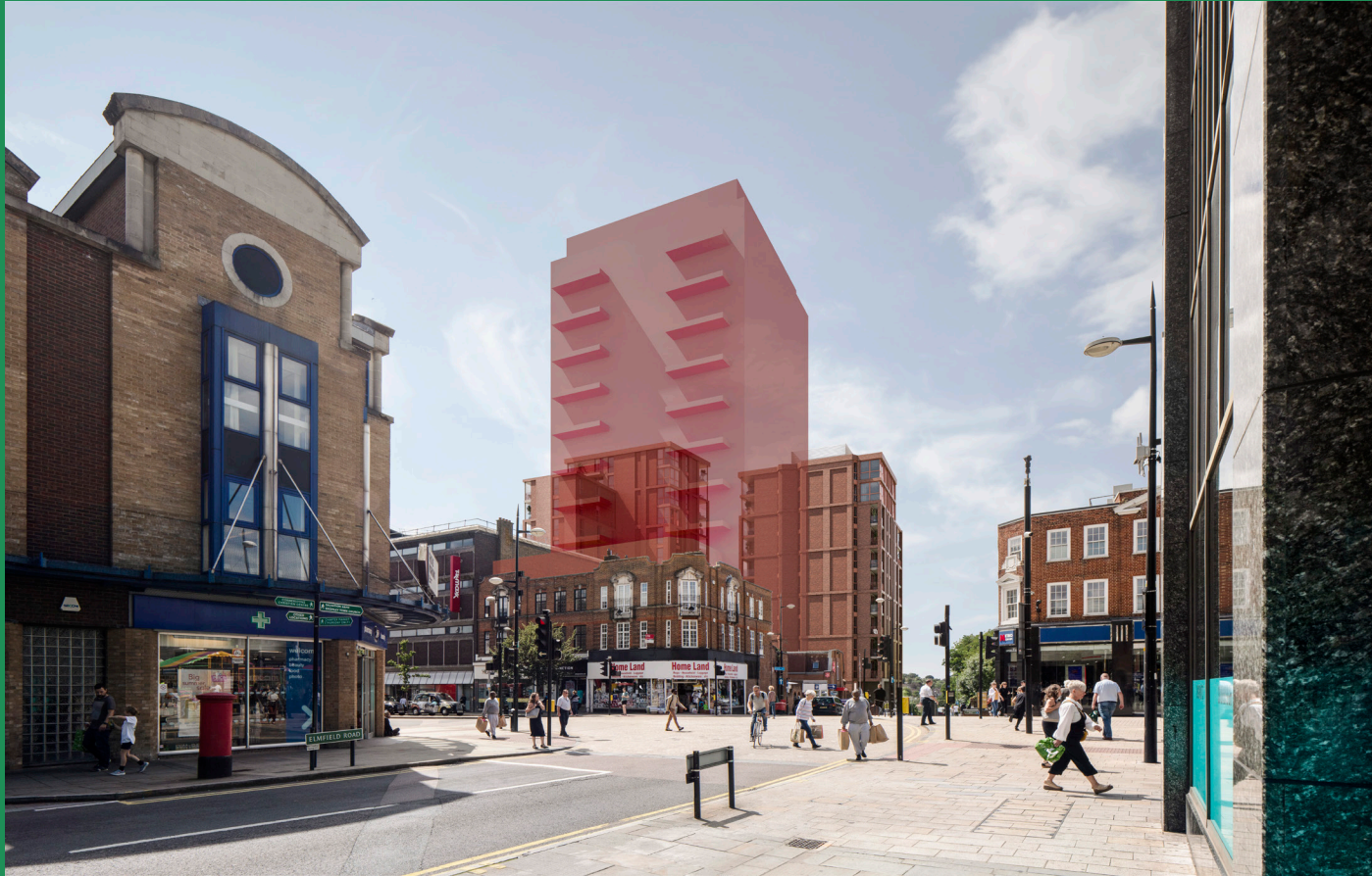
View 101 B - Elmfield Road