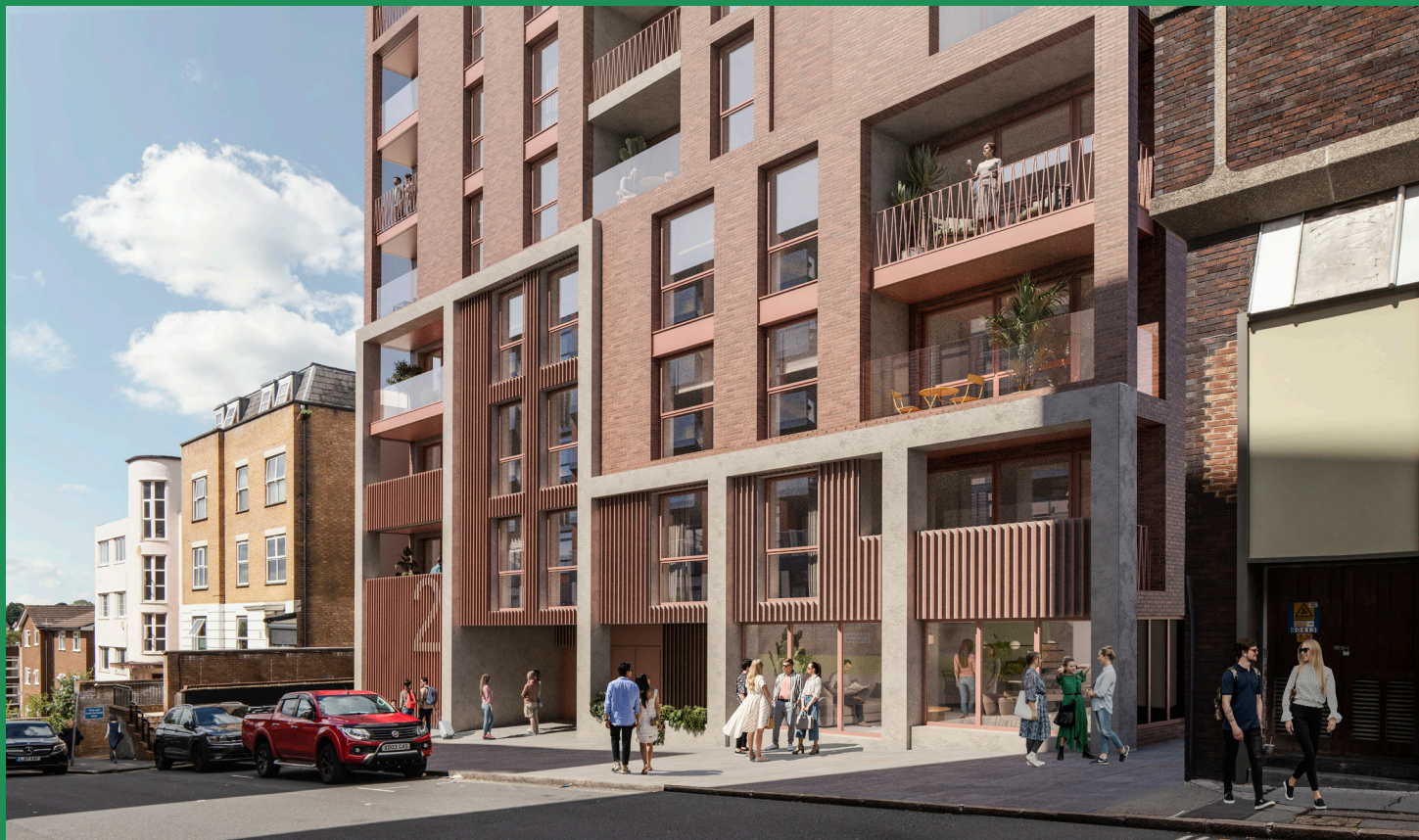
View 106 - Ringers Road