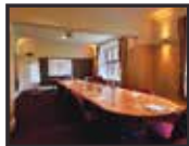
The Conference Room