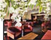
The Hayes Room