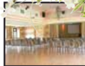
The Coney Suite