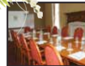
The Committee Room